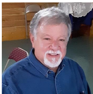
the envelope back.

PROGRAMS: The color green has been associated with St. Patrick’s Day since it was introduced to the festival in the 18 th century. At that time, the shamrock became the national symbol of Ireland. Because of the shamrock’s popularity and Ireland’s landscape, the color of the shamrock became associated with the holiday.