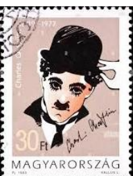
Charlie Chaplin Actor