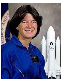
Sally Ride Astronaut