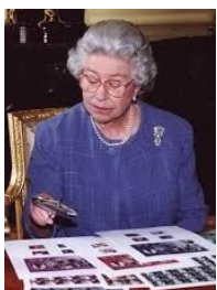
HRH Queen Elizabeth II