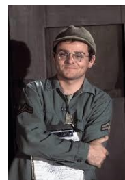
Gary Burghoff “Radar” MASH