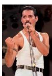
Freddie Mercury Singer “Queen”