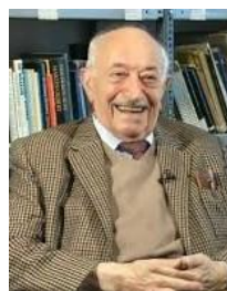
Simon Weisenthal Nazi hunter