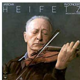
Jascha Heifetz Concert Violinist