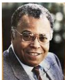
James Earl Jones (Darth Vader)