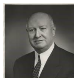
James A. Farley Postmaster General