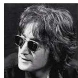
John Lennon Singer/songwriter