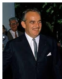
HRH Prince Rainier (Monaco)