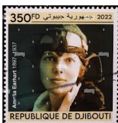
Amelia Earhart Aviator